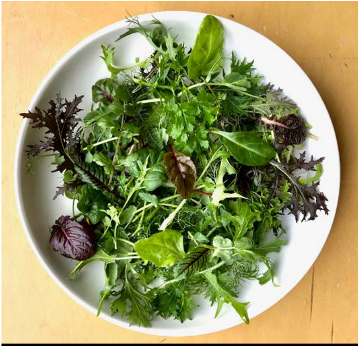
The salad is slowly waking up, enough for a meal for two