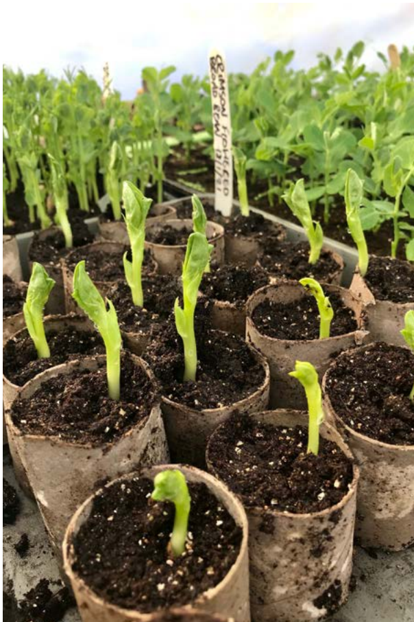
Broad Beans Crimson Flowered

Remember send in photos of your garden to horticultural.society@btconnect.com Don't forget our online AGM on March 17th a link will be sent out to all members, be great to see you on screen, stay safe.