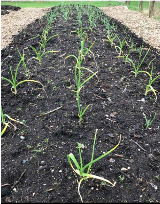
Garlic mad! over 250 cloves planted