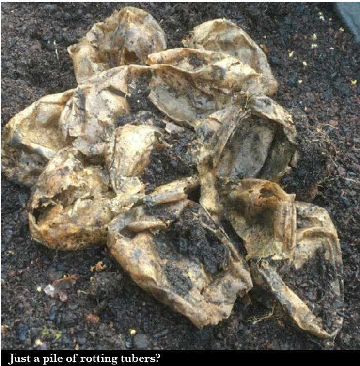
Just a pile of rotting tubers?