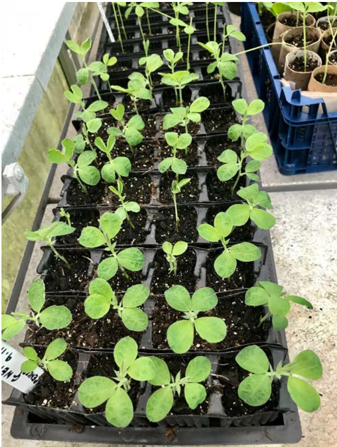
Roger Parsons Gwendolyn Sweet Peas, great germination