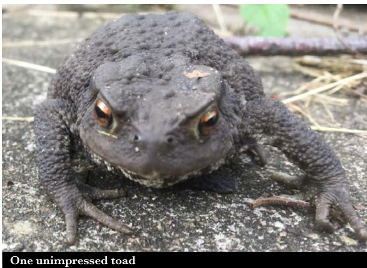
One unimpressed toad