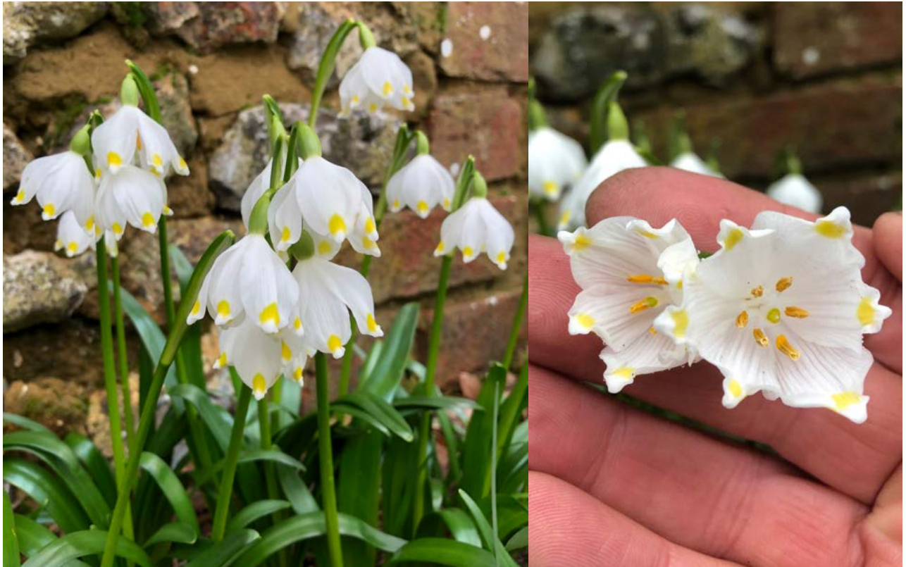
One of the most beautiful variety of snowdrops, Leucojum vernum carpathicum